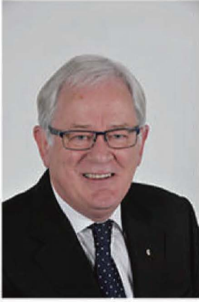
The Hon Andrew Robb AO Former Australian Minister for Trade and Investment